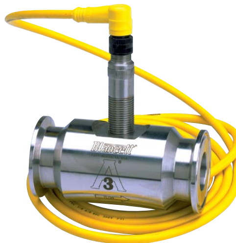
FloClean 3-A (COP) Sanitary Meter with NEMA 6 pick-up (P.N. B16A-110A-1BA)

The FloClean output signal is a sine-wave that is proportional to volumetric flow. With optional Blancett electronics, FloClean provides local flow rate and volume totalization and will interface with most displays, PLCs and computers.