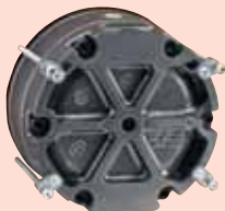
Back view shows flush mounting adapters.