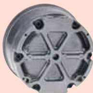
Back view for surface mounting.