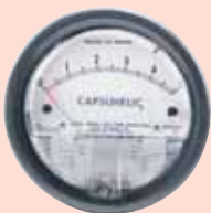
Flush mounted in panel.

Capsuhelic® gages may be flush mounted in a panel or surface mounted. Hardware is included for either. For flush mounting, a 4 1/8" diameter cutout in panel is required. Where high shock or vibration are problems, order optional A-496 Heavy Duty flush mount bracket. Optional A-610 kit provides simple means of attaching gage to 1 1/2"-2" horizontal or vertical pipe. Installation is same as Magnehelic® gage shown on page 4. All standard models are calibrated for vertical mounting. Gages with ranges above 5 in. w.c. can be factory calibrated for horizontal or inclined mounting on special order.