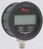
DPGW with Protective Rubber Boot