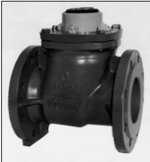
Model 210 – hot Sizes 2”, 3”, and 4” Sizes 6”, 8”, and 10” (red)