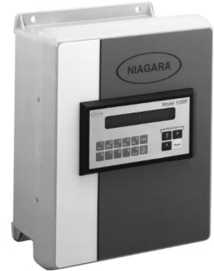
Figure 1. Model 1030FW Indicator/Totalizer